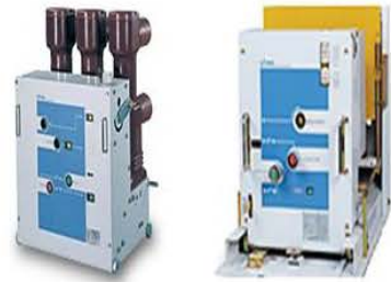
❖ VCB : Vacuum Circuit Breaker