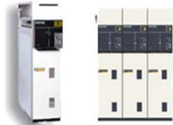
❖ CGS : Compact Gas-isolation Switch