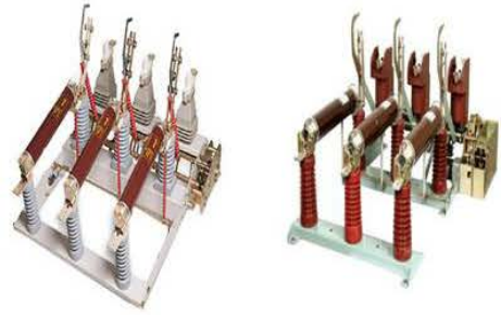
❖ LBS : Load Break Switch