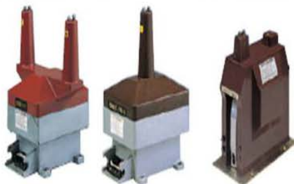
❖ PT : Potential Transformer