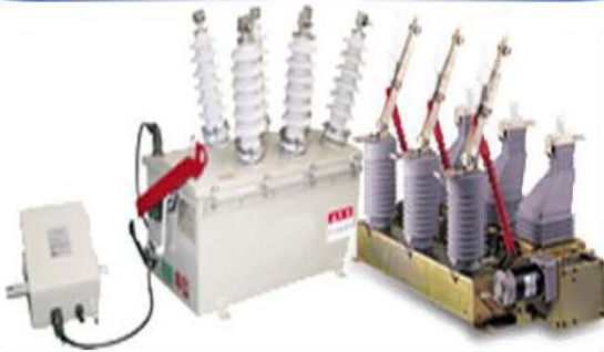
❖ ASS : Automatic Section Switch