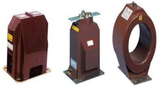
❖ CT : Current Transformer