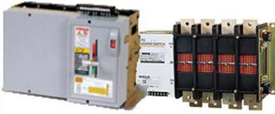
❖ ATS : Automatic Transfer Switch