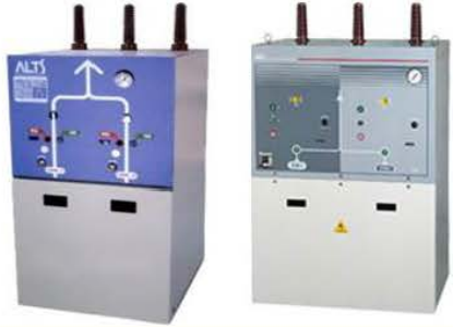
❖ ALTS : Automatic Load Transfer Switch