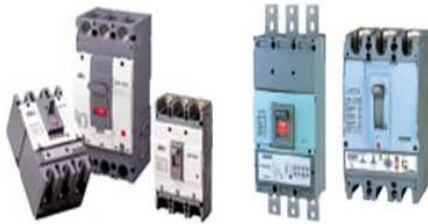
❖ MCCB : Molded Case Circuit Breaker