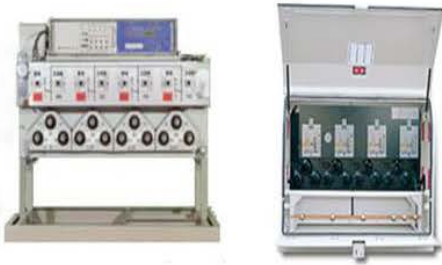
❖ GLBS : Gas Insulated Load Break Switch