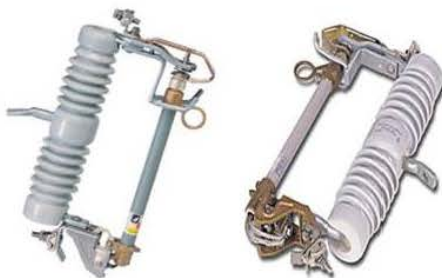
❖ COS : Cut Out Switch