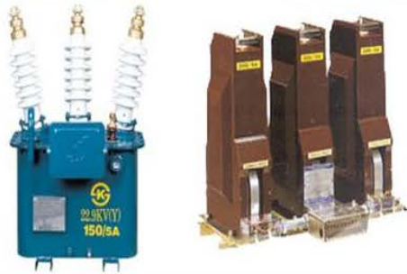
❖ MOF : Metering Out Fit